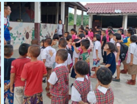
泰北僑校集合團體活動 Group activities at overseas Chinese schools in Northern Thailand