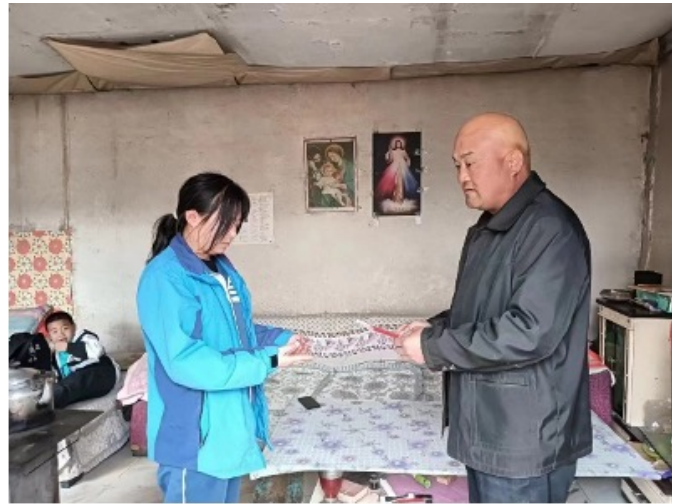
蘭州金城社福中心志工老師送助學金到學生家，順便做家訪。Lanzhou Jincheng Social Welfare Center volunteers deliver scholarships to students' homes.

還有好多類似情況的孩子們，小小年紀就面對非常變故，希望蒲公英繼續幫助他們完成學業夢想。