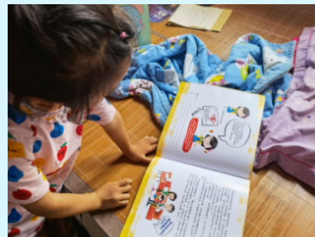
受助學童在服務中心看書交流 Students read and play with friends at the service center