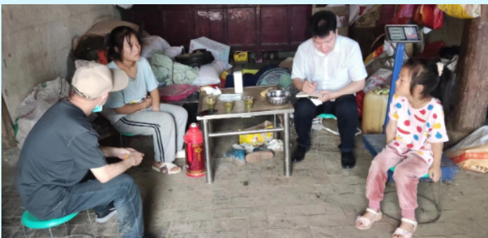
助學家訪，生活輔導與防輟學陪伴成長支持 Home visits, life coaching and anti-dropout guarantees to accompany growth and support